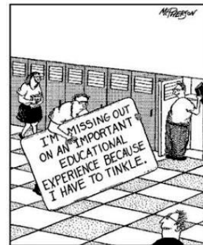
The school's new hall passes proved to be extremely effective in discouraging frivolous trips to the rest room.

TO PARENT/GUARDIAN: My role as a parent/guardian is that of an encouraging supporter. I will not be a source of disparagement; rather, I will seek to boost my child's self esteem by providing positive reinforcement. I realize that a discouraged student has a more difficult time in school (and life) and that it is my role, not to fixate on past disappointments, but to focus on future improvement. I'm also aware that I cannot make generalizations about what is a "good grade" or a "bad grade" in the class as generalizations like those are rarely substantiated.